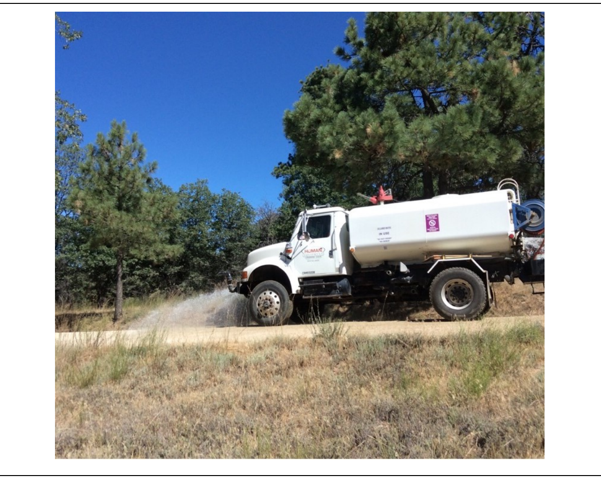
Photo 1: A water tender was observed applying water on Los Huecos Road (C 440 Phase II) to minimize dust emissions throughout the day in accordance with APM AIR-02.