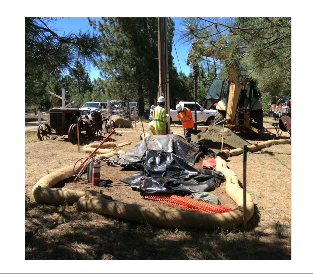
Photo 5: A crew was observed digging a direct bury pole hole at P45115 (C 440 Phase II). Erosion control BMPs at the site were observed in good condition in accordance with the ECP (MM HYD-1) and SWPPP (MM HYD-1, MM BIO-7).