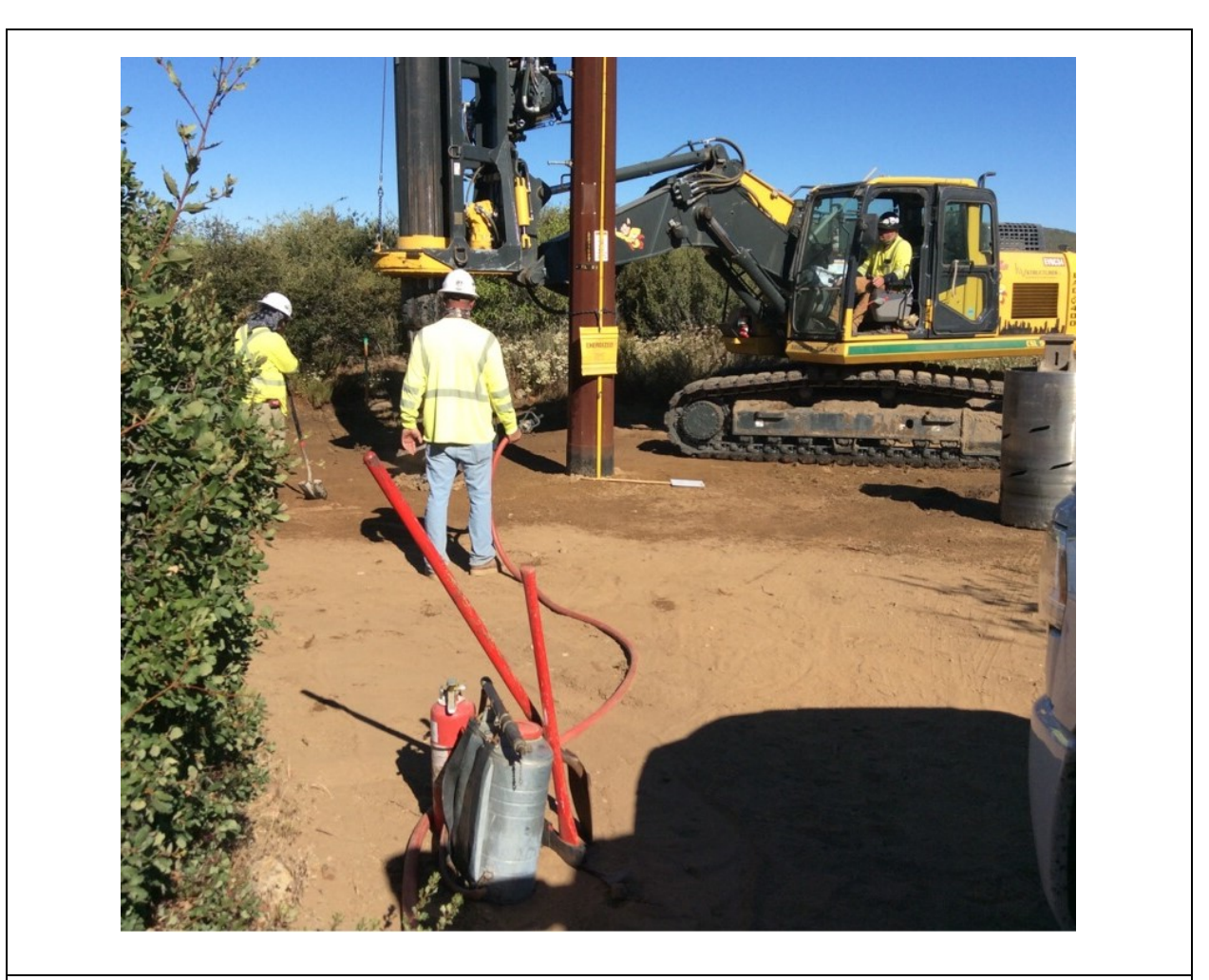
Photo 4: A crew was observed drilling a direct bury pole hole at P258505 (C 79B). A Dedicated Fire Patrol, at least 150 gallons of water with pump and hose, and a full set of fire tools were observed on site in accordance with the CFPPP Fire Prevention Matrix (MM FF-1) for foundation drilling on USFS land with a PAL Ev.