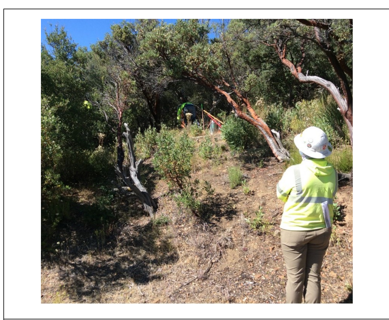
Photo 2: A Biological Monitor was observed monitoring vegetation removal at the anchor site at P874922 (C 79B) in accordance with MM BIO-3.