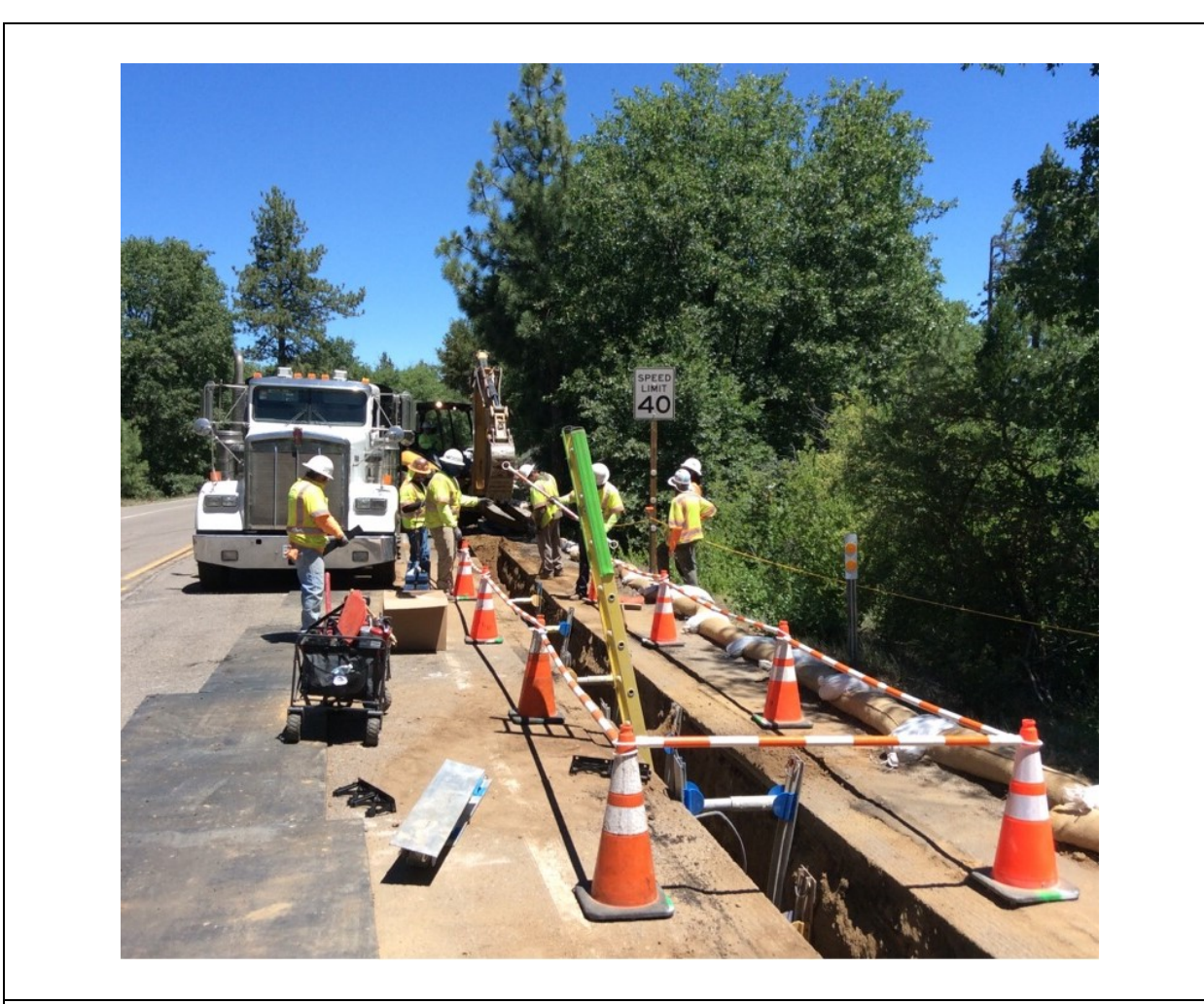
Photo 3: A crew was observed excavating a trench on Sunrise Highway along C 440 Phase II. Archaeological and Cultural Monitors were observed monitoring the activity, and an adjacent Cultural ESA was clearly delineated and avoided by crews in accordance with the HPMP (MM CUL-1), APM CUL-03, APM CUL-04, and MM CUL-1.